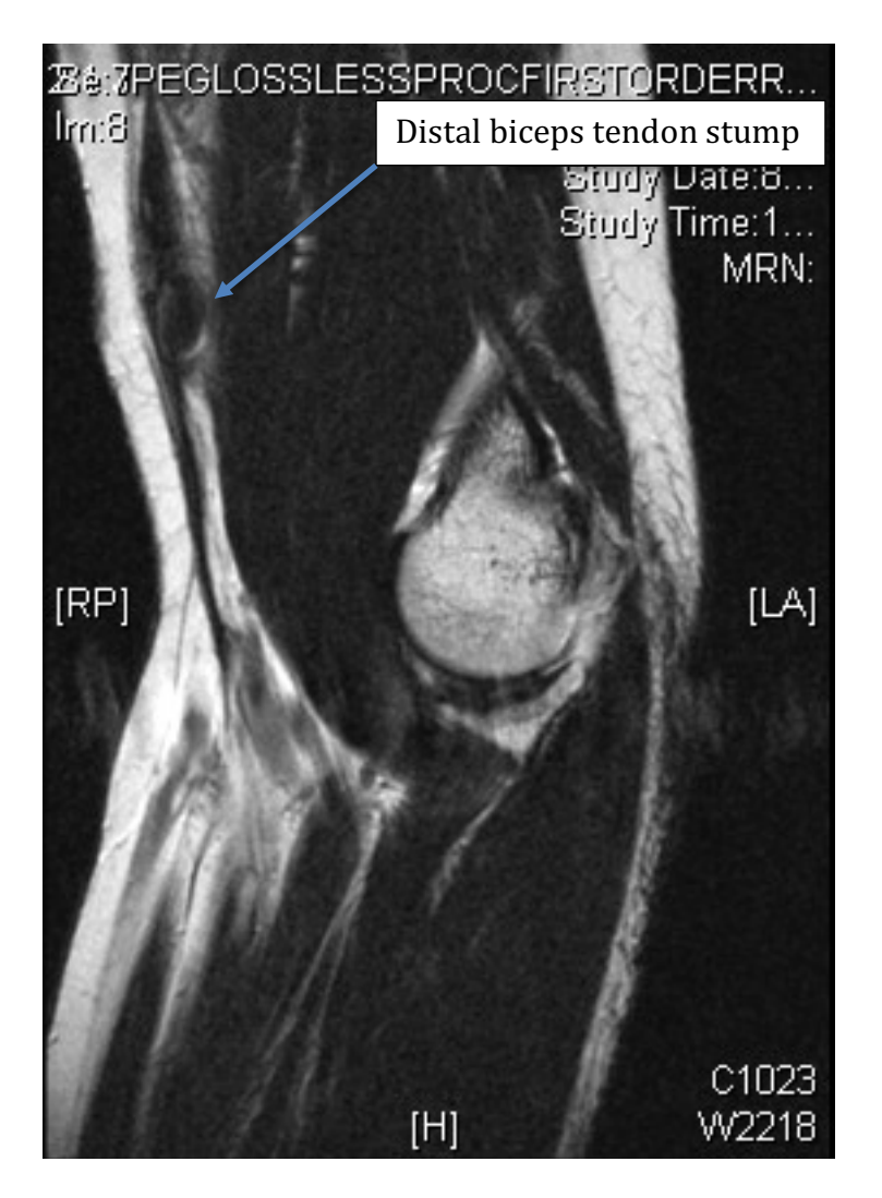
Figure 3 T1-weighted sagittal image demonstrating a chronic rupture of the distal biceps tendon with retraction proximal to distal humerus.